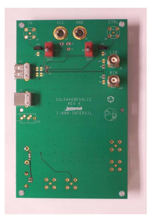
FIGURE 1. ISL54409EVAL1Z EVALUATION BOARD (TOP VIEW)